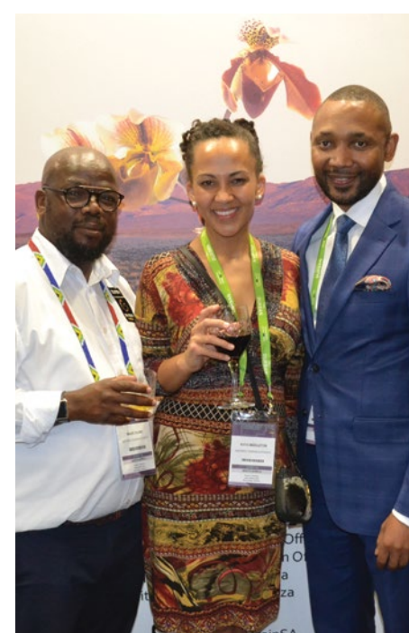
The Blue Train returned to the Travel Indaba.