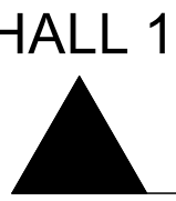
Floor Layout 1:340 GRID 1 BLOCK = 1MX1M