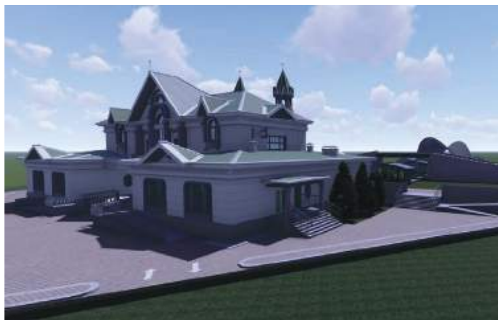
The proposed Bay Train Station with the SA Rail History Museum in the background.

Harties Steam Train is expected to operate on a regular schedule, family-friendly